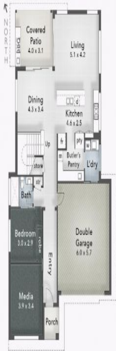
// FLOOR PLAN Ground Floor - 2.7m Ceiling